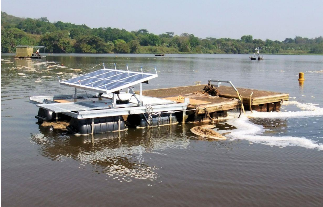
Fig. 2 The solar power-driven deep water removal system at Lake Monoun